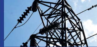
Bulk & Internal Electricity Reticulation