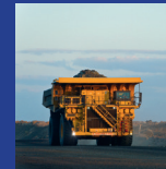
Haul & Access Roads, Bridges & Storm Water